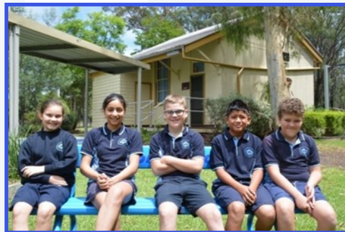
Our 2022 Year Six