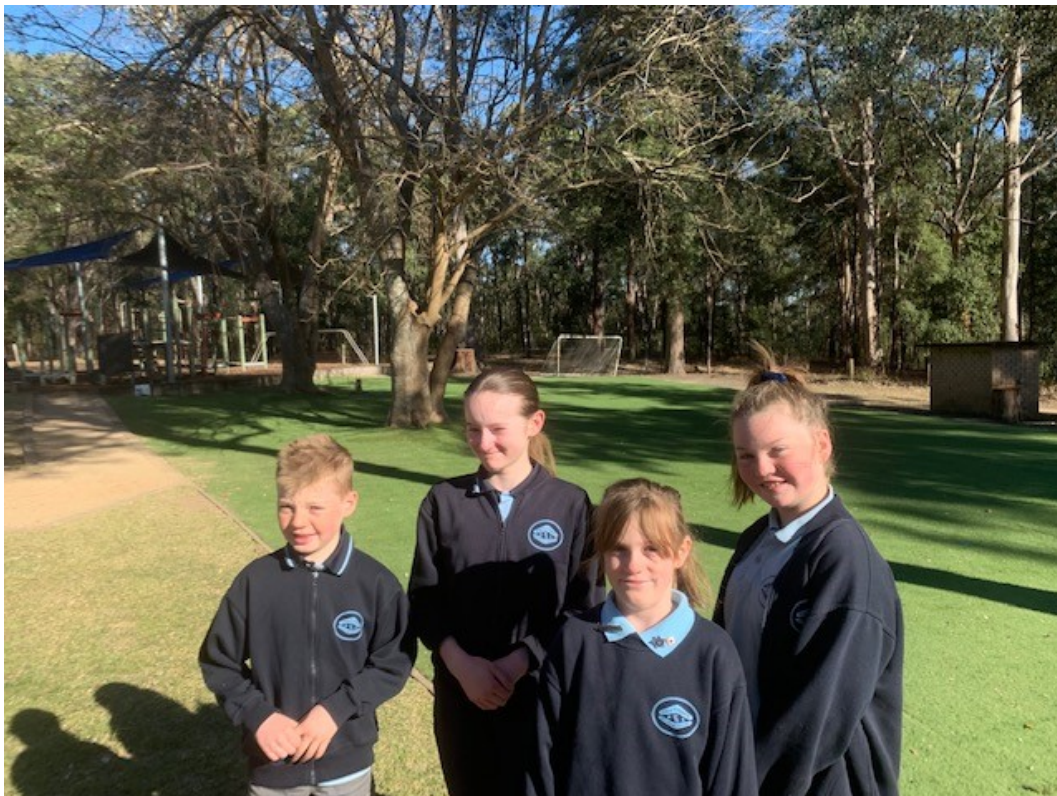
Our Relay Team