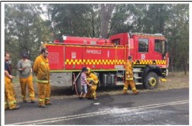
Seven year old Jackson is learning how to use the fire hose from the Commander of the Paynesville Fire Brigade, Victoria.

Some locals have been helping put out the fires. On the 19 th of November local volunteers stepped up to put out the fire at Colo Heights Public School. Even the little kids are helping out, they are wanting to learn how to use the fire hoses to protect their houses in the future. The locals have been cooking for those who are staying to fight the fire and sending the food to the 'Pop Up Shop' which has been started at the service station every day at 6pm.