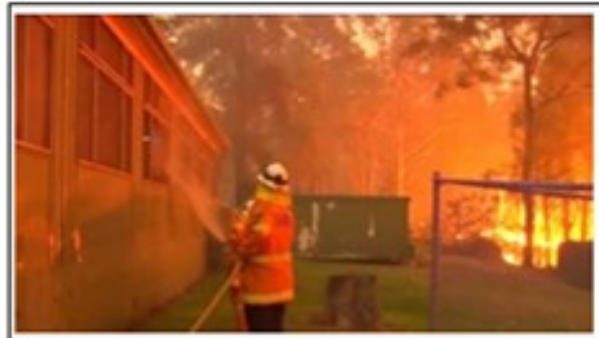
RFS and local volunteer fire fighters at Colo Heights Public School putting out the fire.