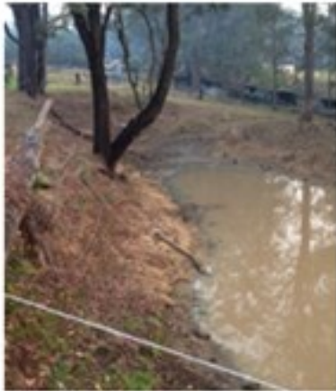
A half empty dam in Colo Heights.